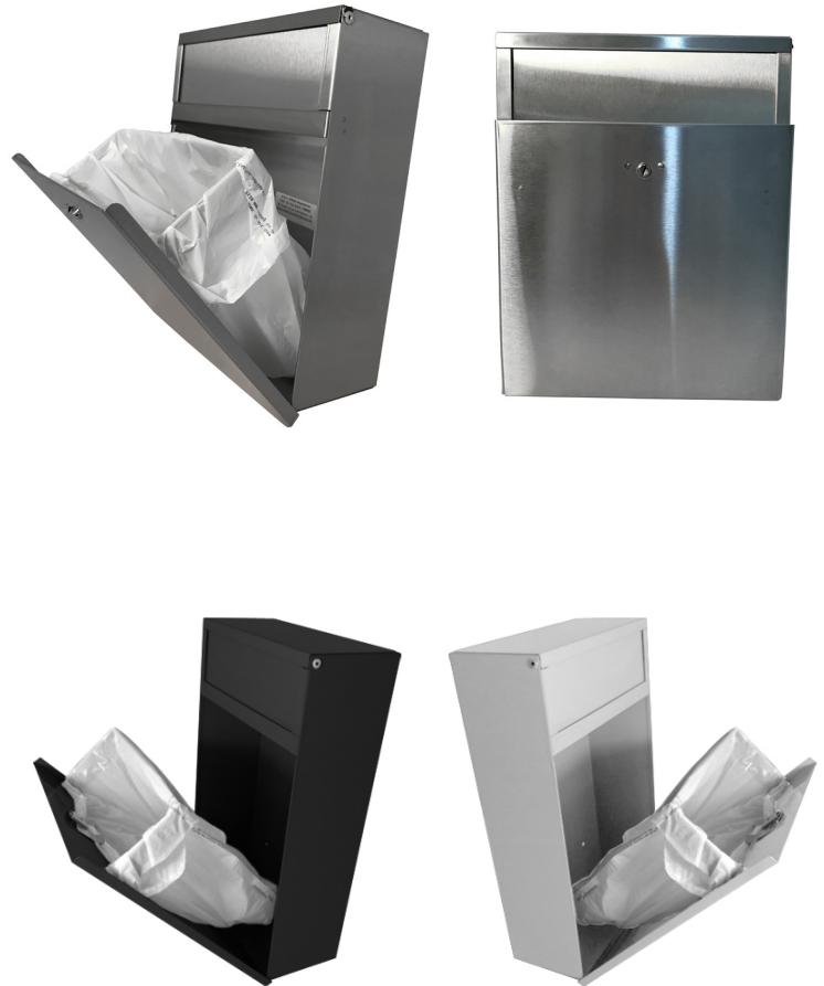
TD9200 shown with TD9022 liner

Available by ordering part number: TD9022-06 (300 bags) or TD9022-24 (1200 bags).