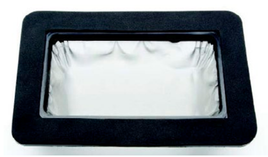
Gross Debris Filter Position the gross debris filter over the disposable filter and attach recovery inlet using the two swivel clamps.