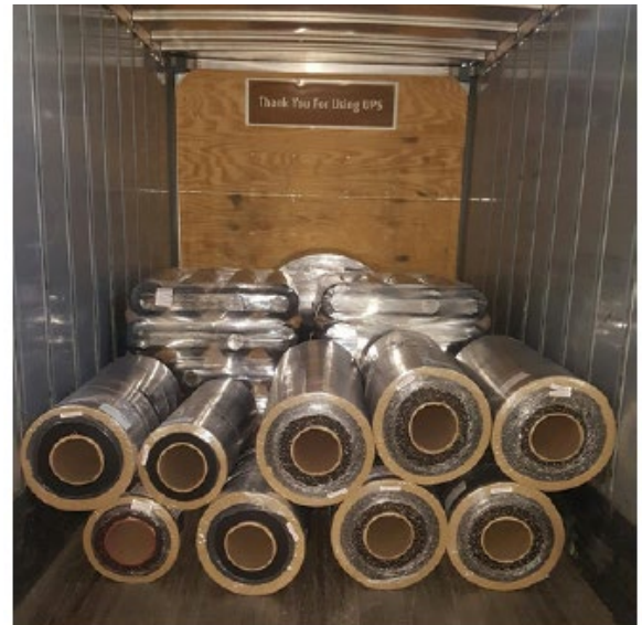
PICTURED: FLOOR LOADED